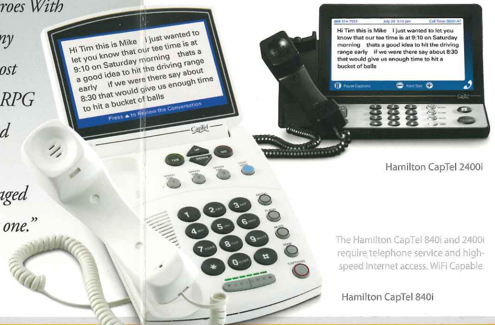
Hamilton CapTel 2400i

The Hamilton CapTel 840i and 2400i require telephone service and high-speed Internet access. WiFi Capable.