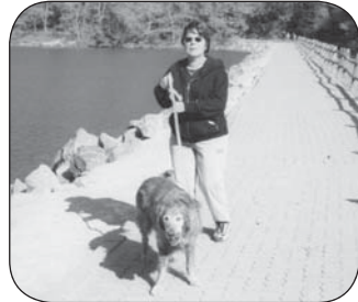
Visitors can enjoy walking their pets on the park walkways.

Please Note: The feeding of waterfowl in Westmoreland County Parks is prohibited.